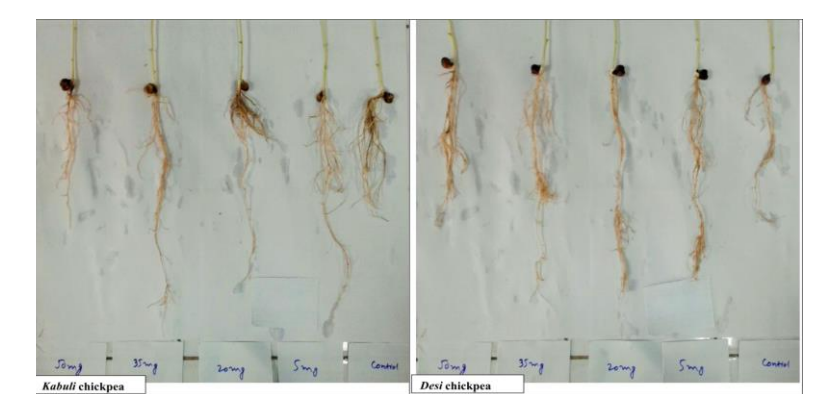
Fig. 1: Influence of different Zn seed coating concentrations (5, 20, 35 and 50 mg kg<sup>-1</sup> seed) on the seedling root growth of chickpea types ( kabuli and desi ) in sand filled pots